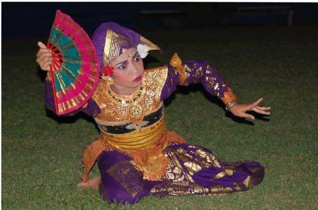
CBG - a dancer at an evening performance and the

For many years the gamelan players of the village practiced traditional Balinese music on our premises on a set of instruments financed by Oldenbruch. Recently, however, for practical reasons, they started training in the community hall of the village. On Sundays the children of the village practice traditional dances and gamelan music at the suggestion of Pak Cilik.