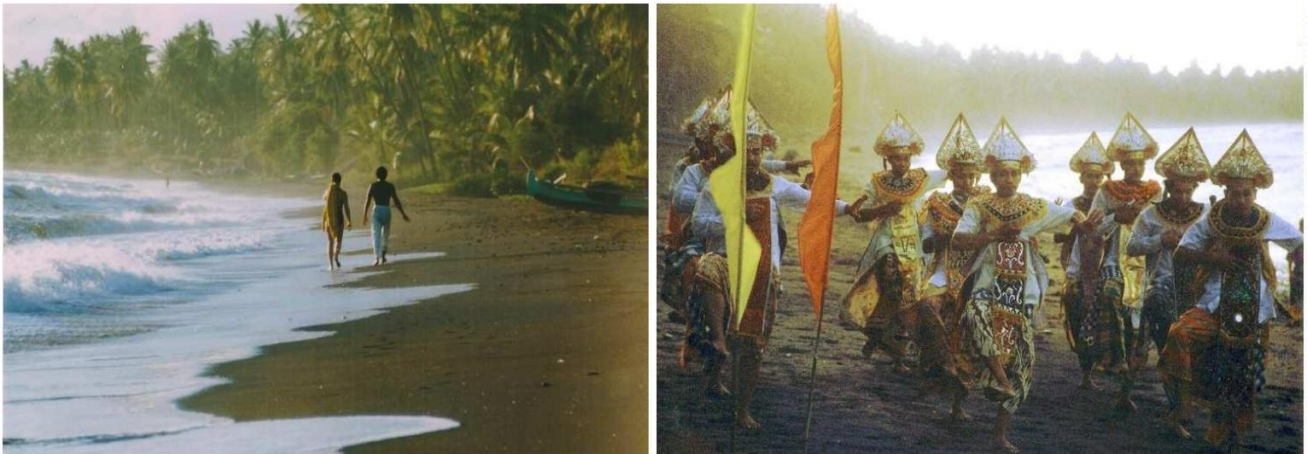
Two historical pictures: The beach in front of our property in Air Sanih in 1983 and a ritual Baris dance during a Melis ceremony at the beach in 1995

Since 1983 I have been living temporarily in South East Asia. The fascination of this region, especially Indonesia and Bali, its impressive nature and culture have made me want to have a fixed point here. At the beginning there was no "tourist object" at all. There was a young befriended Balinese family and a sea property, which stimulated the fantasy of the German friend. Slowly the fantasy was spun into a plan and from the middle of the eighties it was implemented together with the Balinese friends. Gradually German and Swiss partners were added, and so the very private beginnings suddenly turned into a small guest resort. For ourselves and for our guests it is supposed to be a beautiful place of peace and relaxation, for our Balinese friends a pleasant workplace and sustainable income.