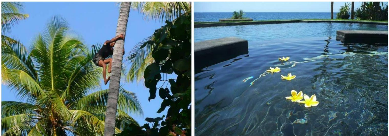
A man from the village harvests coconuts - not exactly easy .... And our freshwater swimming pool not only for days with strong surf

You will find suggestions in a folder in your house, which among other things lists possible activities and experiences that can bring you closer to the unique and special Balinese culture and the still magnificent tropical nature and landscape of the island.