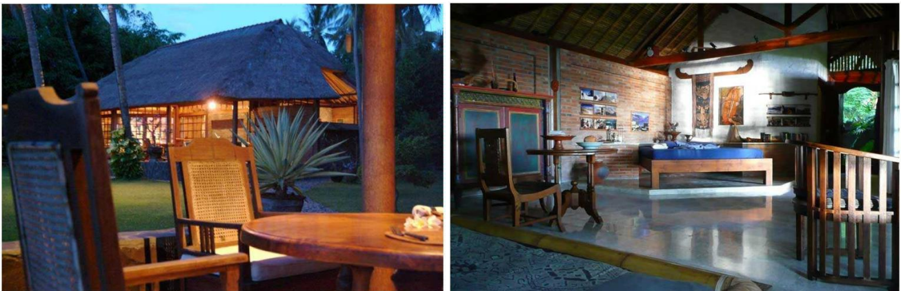
CBG - The Villa East in the early evening from the pavilion and the very personal designed interior of Villa West

This effort began even before the construction of the first house, when we, together with some villagers, worked to preserve and protect the coastline, which was severely endangered by erosion and years of sand mining. In the meantime, a balance seems to have been achieved: through a strict and largely enforced ban on commercial mining of sand and pebbles, through the construction of a stable protective wall and through a revival of traditional use structures of coastal properties, favoured by the meanwhile larger number of private, small holiday resorts in the area. Even in the wider area, there are no large hotels, but only manageable private resorts and restaurants, all committed to sustainable development.