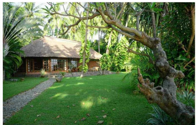
and the spacious beach garden of our guest villas

The Oldenbruch couple, who could no longer travel due to their age, were replaced at the beginning of 2012 by the young Swiss Zbinden family with their children.