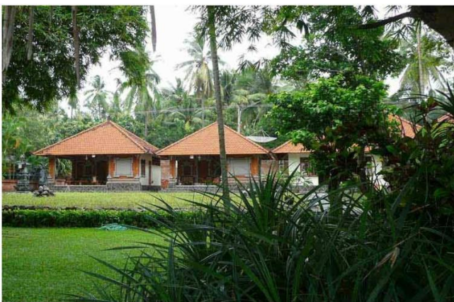
CBG: The "kampung" of our Balinese partners